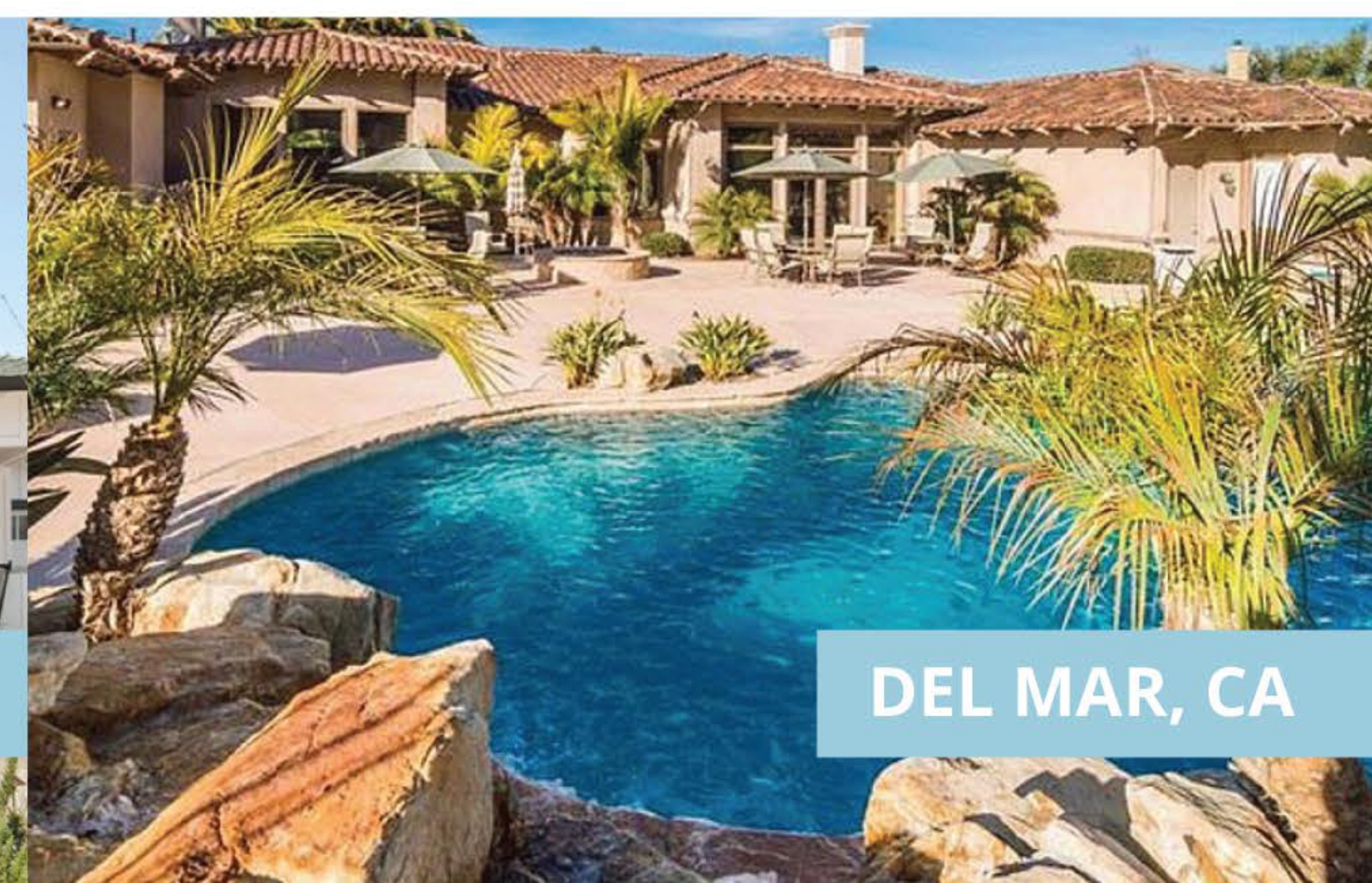
DEL MAR, CA